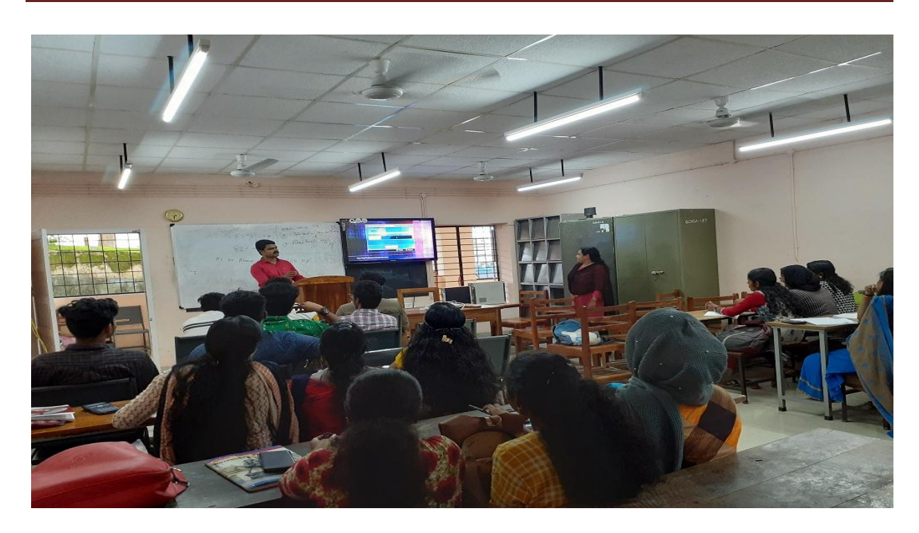
Smart Class Room