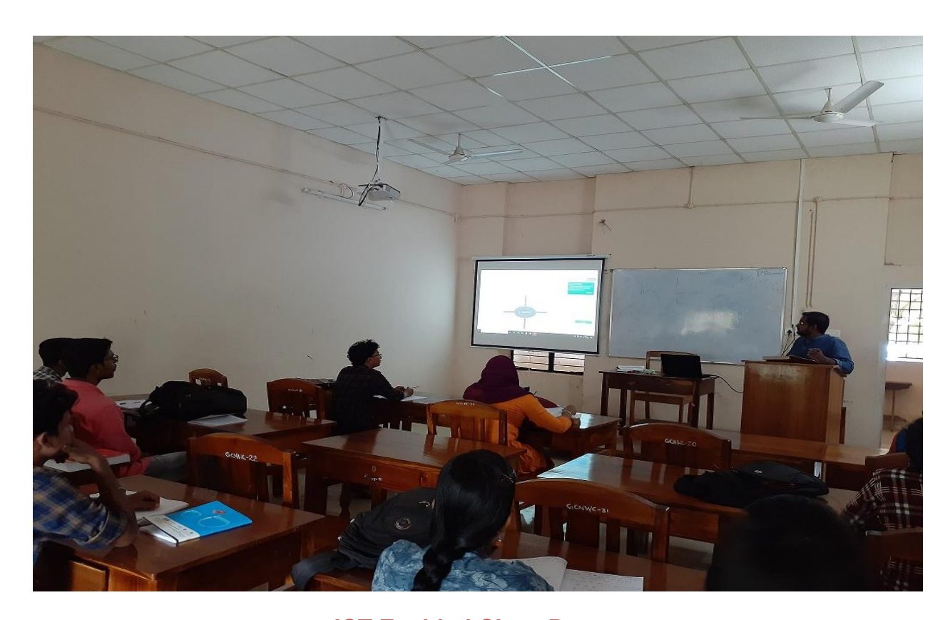
ICT Enabled Class Room